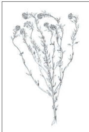
Figure 3. Stem of hoary alyssum.

coloration. The name “hoary” denotes the rough hairs on the stems, leaves and fruit. Hoary alyssum has numerous white flowers with four deeply divided or notched petals. Seed pods are round to oblong (5 to 9 mm long, 3 to 4 mm wide), slightly flattened, hairy and swollen, with a short beak or point on the end (Figure 4). The seed pods are usually held close to the stems.