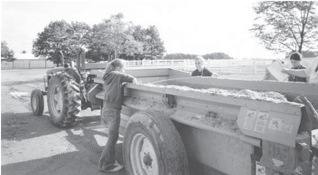
4H'ers learn how to calibrate a manure spreader.

Michigan State University was humming with life this past June 23-25, when nearly 3,000 youths from all parts of Michigan ranging in age from 11 to 19, traveled to Michigan State University to participate in the 2004 4-H Exploration Days. It offered more than 170 hands-on learning sessions, field trips and leisure opportunities.