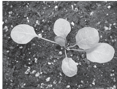
Figure 1. Hoary alyssum seedling.

In extreme cases, severe swelling of the lower legs, apparent founder, stiffness in joints and death have been observed in horses ingesting hay containing high percentages (30 to 70 percent) of hoary alyssum. Results of ingestion of hoary alyssum are somewhat variable, however. In one study, only about half of the horses showed any clinical signs of toxicity when they ingested hay containing 30 to 70 percent hoary alyssum. The clinical signs are milder with ingestion of hay containing lower percentages of this plant. It is recommended that hay containing greater than 30 percent hoary alyssum not be fed to horses.